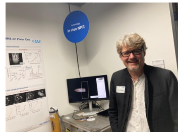
2025 during AWI HGF evaluation